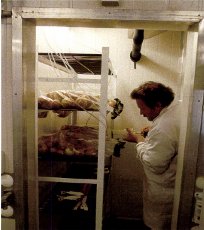
Figure 3: Taking gas samples to be analysed.

measured and recorded throughout the experiment (Fig. 3). A CO 2 gas analyser (Analytical Development Co., England) was used to test gas concentrations.