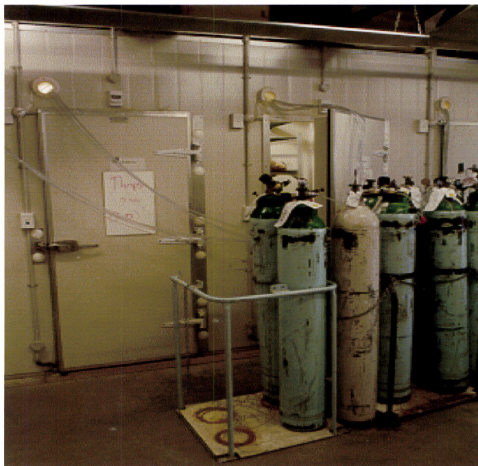
Figure 1: The gas delivery system.

During March 2001 a trial was conducted at Crop & Food Research, Palmerston North, looking at differing CO 2 concentrations and their effect on the mortality of both larvae and adult onion thrips ( Thrips tabaci ). Harvested Pukekohe Long Keeper onions (cv. Dominator, Pukekohe grown and export grade) which were naturally infested with onion thrips. A replicated gas delivery system using certified gas via pressurised gas cylinders (BOC Gases; Palmerston North) was designed to deliver various CO 2 concentrations in a constant supply to thrips-infested onions.