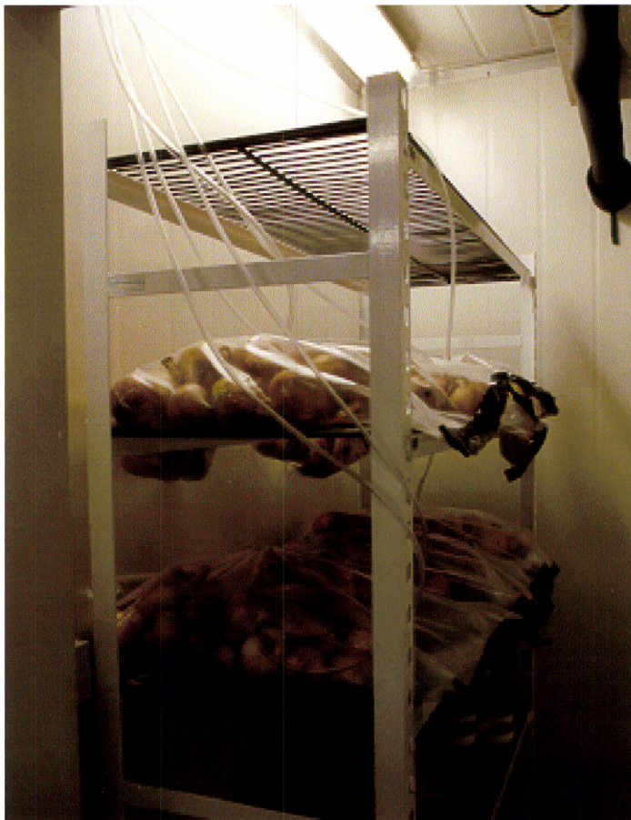
Figure 2: Infested onions being gassed in resealable plastic bags with gas inlet.

Onions were cut into two pieces. The first and second brown membranous skins were removed as well as one of two layers of the white fleshy bulb scales, depending on the presence or absence of live thrips under the brown skins. On the lower part, any membranous skin was removed and the area peeled near the roots and checked. If thrips were present the flesh scales were separated as well.