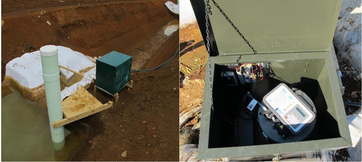
Figure A4. Monitoring equipment provided by NIWA.