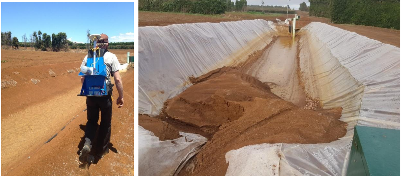
Figure A2 (Left). Bedload accumulation measurement by mobile laser survey. Figure A3 (Right). Volume of sediment in Pond 1 following flooding in March 2017.