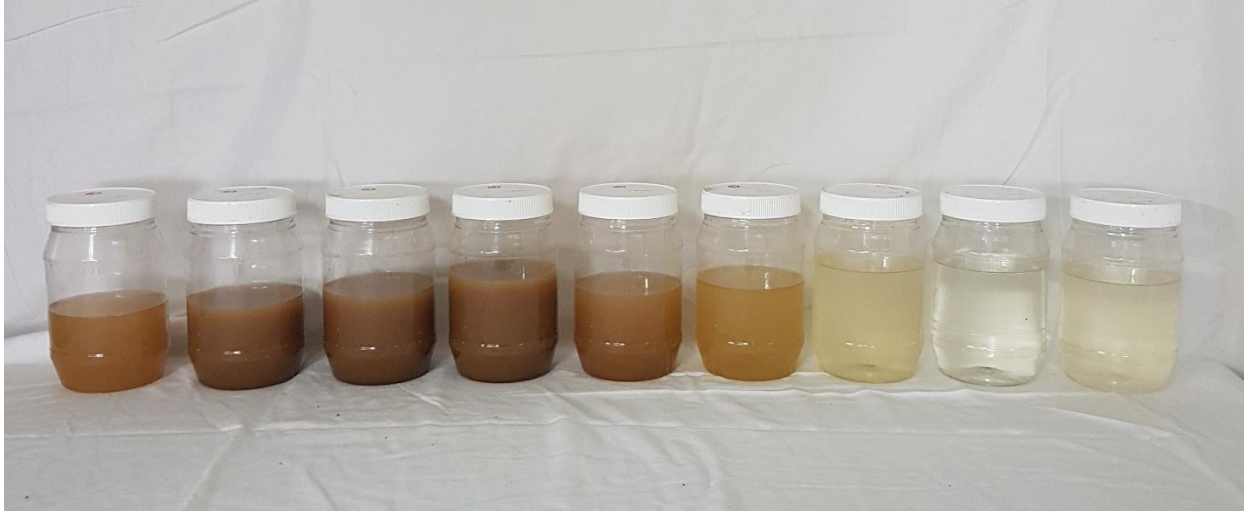
Figure 1. Pond 1 inlet samples showing a gradient of sediment runoff during a rainfall event