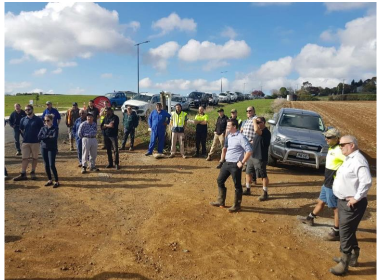
Figure A7-A8. Erosion control workshop held at the trial site in Pukekohe.