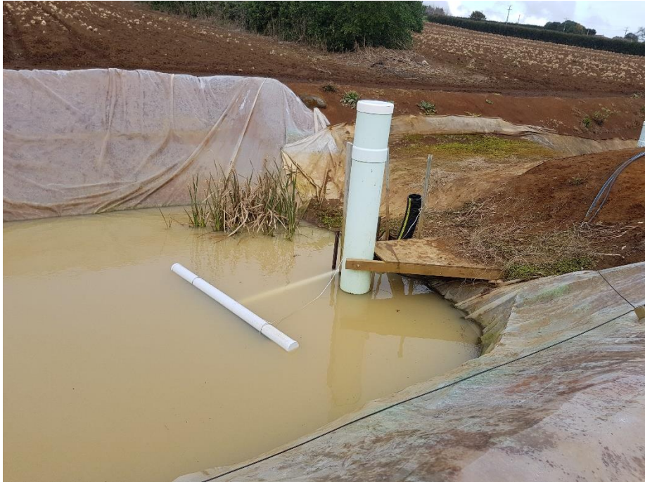
Figure A5. Floating decant installed in Pond 1.