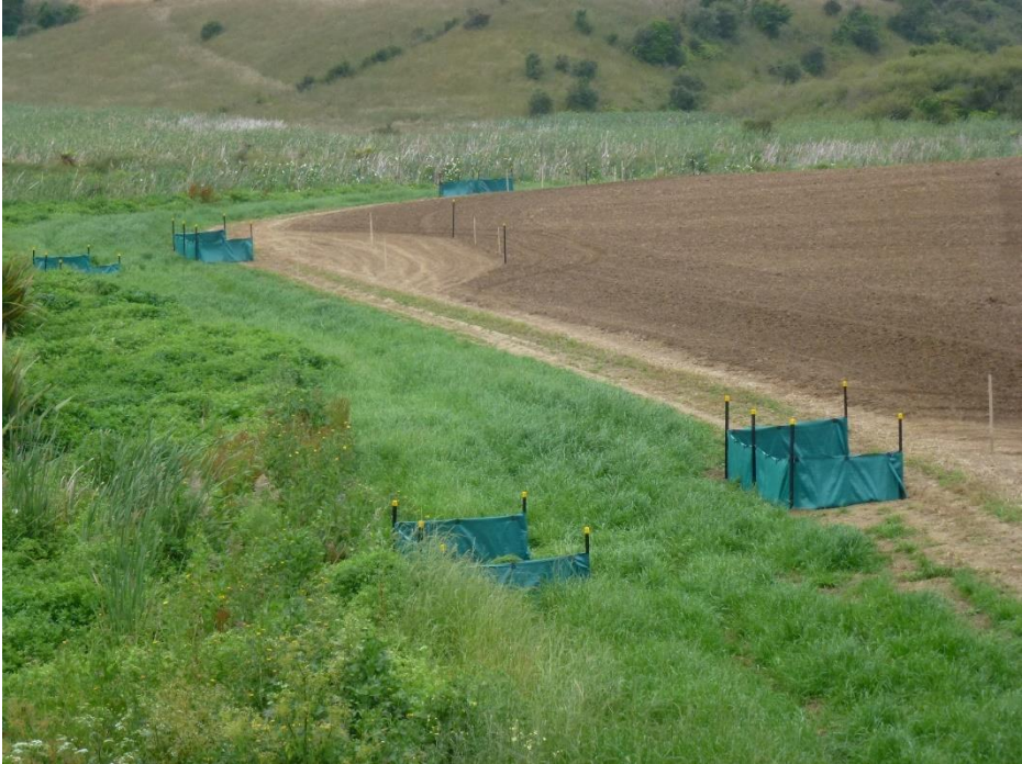
Figure 2. The vegetated buffer trial in Levin.

In Levin, 3-5m grass buffer strip plots were established to determine their effectiveness on a range of slopes and row lengths. Deposition was measured by trapping eroded soil using silt fences at the bottom of the fields. The magnitude of deposition was measured using arrays of erosion pins to characterise changes in surface elevation.