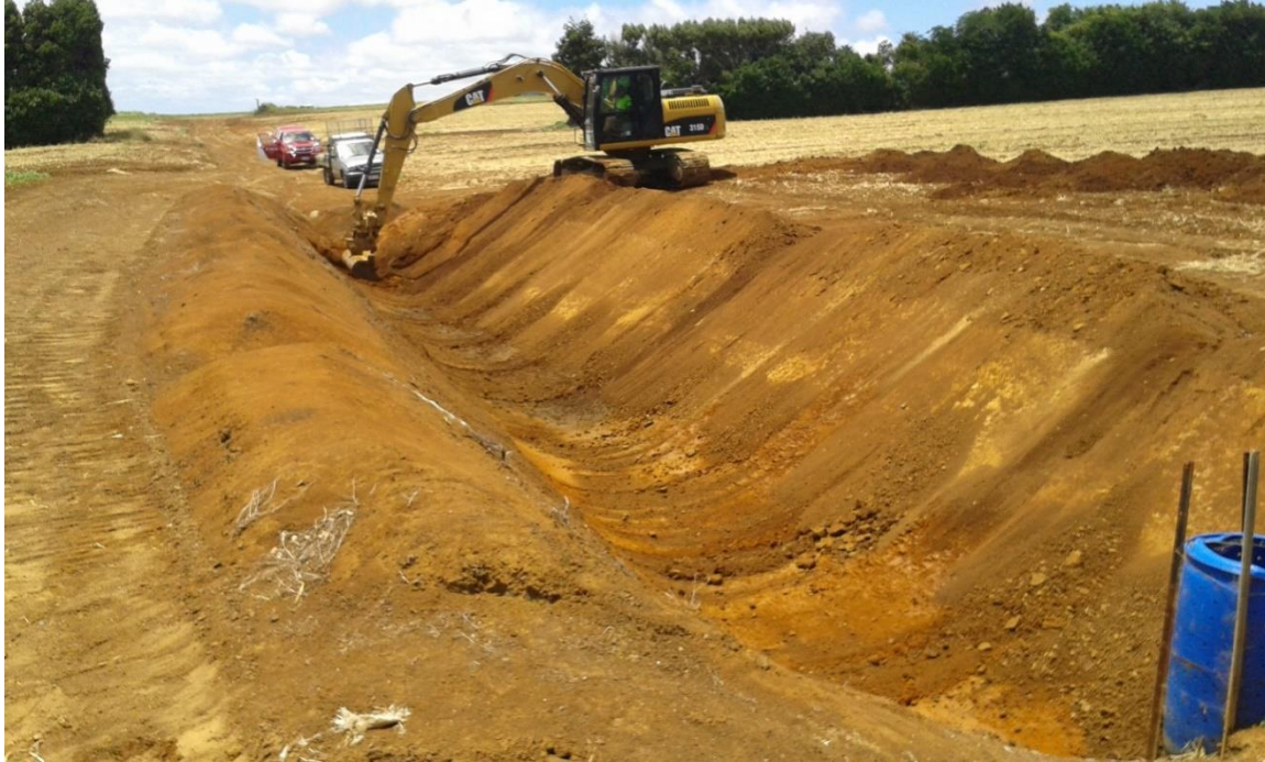
Figure A1. Excavation of Pond 1 at the beginning of the project in December 2015.