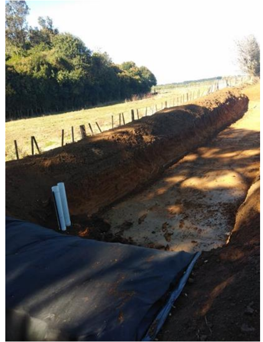
Figure A5-A6. A grower installing an SRP, following directions from a Farm Environment Plan prepared as part of the project extension.