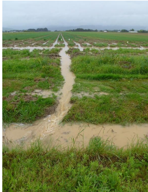
Figure 4. Grass buffer strip with a channel cut through it delivering dirty water into the drainage system.

Water ponding behind bunds on flat land is a significant issue. Observations around the Levin district shows some buffer strips had channels cut through them to prevent flooding of the paddocks. This then severely compromises their effectiveness (Figure 4). The installation of vegetated buffer strips needs to be done in such a way to minimise channelising.